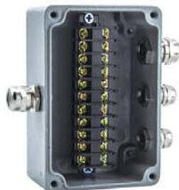
Metal connector + TBC terminal