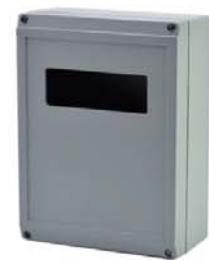
Cut out hole