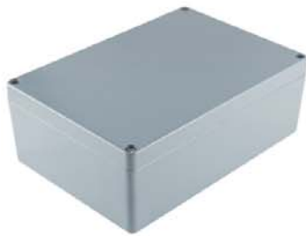
4 fixing screws