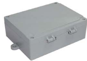
With mounting bracket Hinge cover