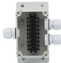
Plastic connector+ TBC terminal