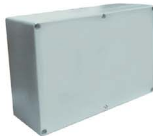
6 fixing screws