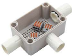
Pipe joint + quick connector