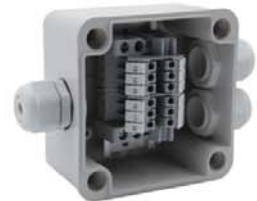
Plastic connector + UK terminal