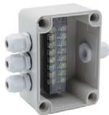
Plastic connector + TB terminal