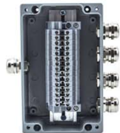
Metal connector + UK terminal