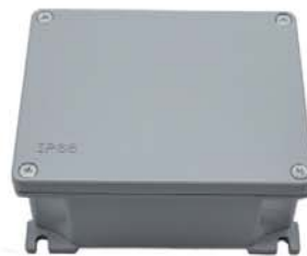
With mounting bracket