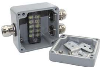
Metal connector + TB terminal