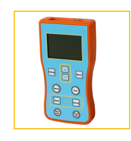
Remote Control Remote control for solar LED bollard light