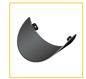
Round House Side Shield To reduce glare light